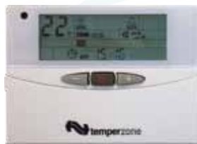
Optional SAT Wall Thermostat for non-digital systems up to 27kW