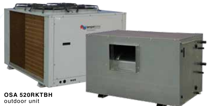
OSA 520RKT outdoor unit