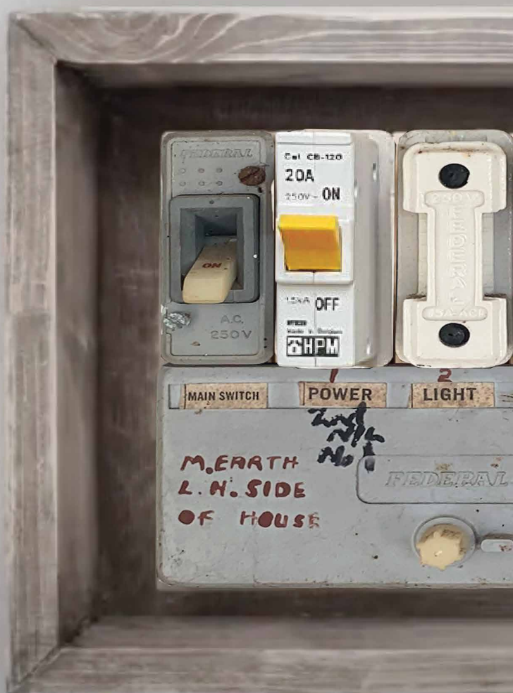
Unprotected Dangerous Switchboard