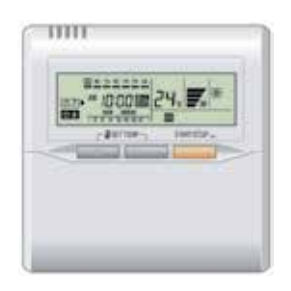
Wired Remote Controller*