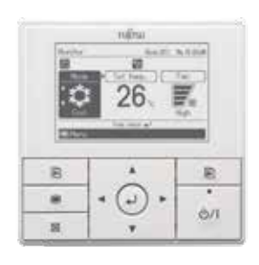
Backlit Wired Remote Controller*